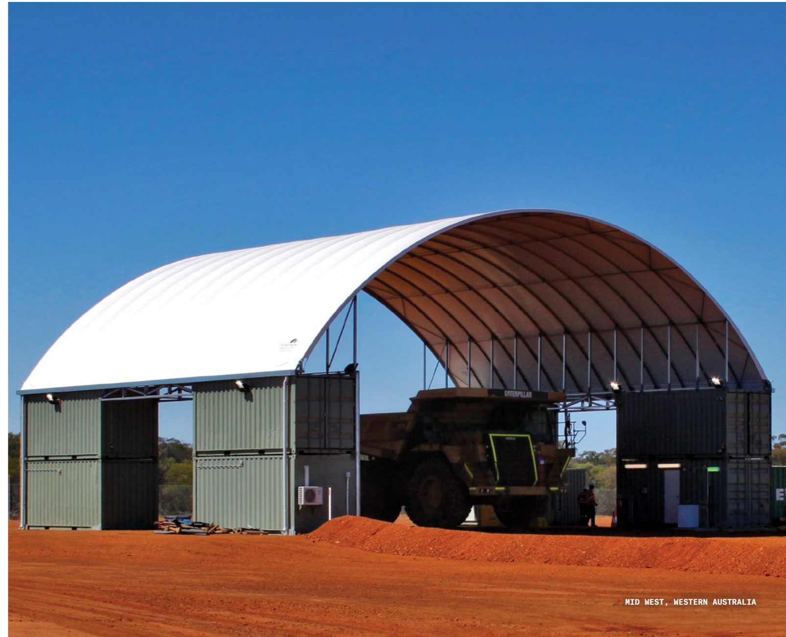
MID WEST, WESTERN AUSTRALIA