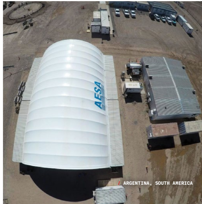
ARGENTINA, SOUTH AMERICA

We strive to continually innovate and exceed customer expectations with high quality, durable and Fit-For-Purpose Shelter Solutions exported to the world.