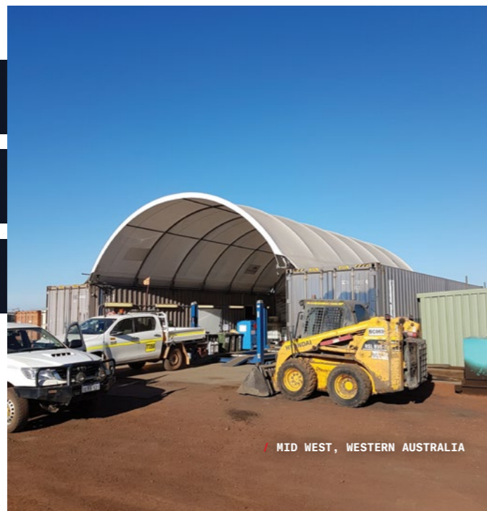
MID WEST, WESTERN AUSTRALIA