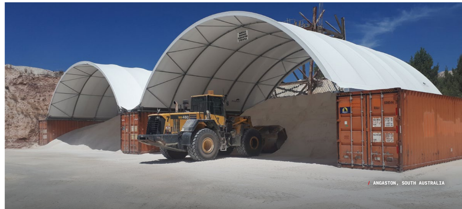
ANGASTON, SOUTH AUSTRALIA